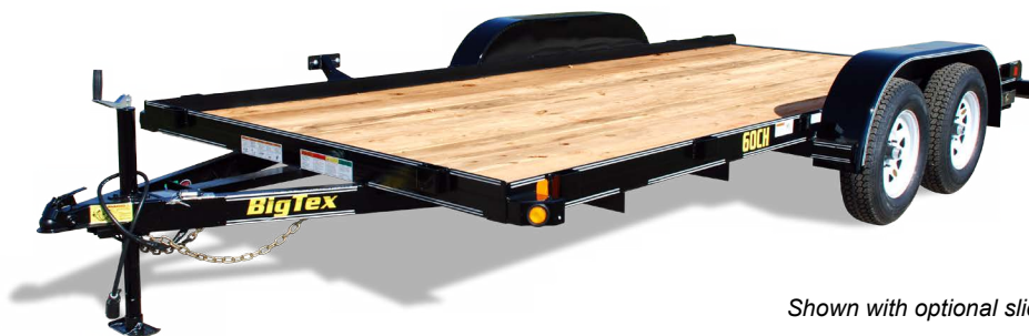
Shown with optional slide-in ramps and spare tire mount