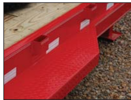
Diamond Plate Running Boards