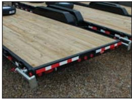
Straight deck w/ 5' Slide-in Ramps