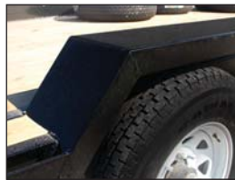
Drive Over Fenders