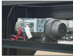
Winch 12VDC (12,000 lb.)