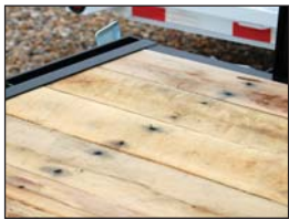
Rough Oak Floor