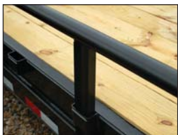
2 3/8" Pipetop Removable Siderails (CC, C8)