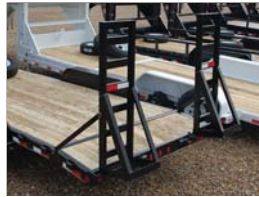
2' Dovetail w/ 5' Fold-up Ramps