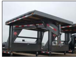
Deck on the Neck (GN Only)