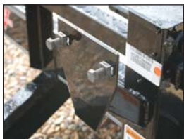
Spare Tire Mount