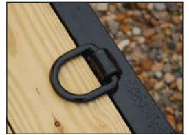
1 Pair D-Rings